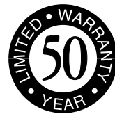
Heritage Premium Heritage Vintage

HERITAGE® VINTAGE® • HERITAGE® PREMIUM • HERITAGE WOODGATE® • HERITAGE® • ELITE GLASS-SEAL®