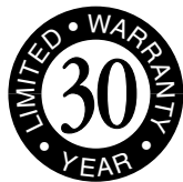
Heritage Woodgate Heritage